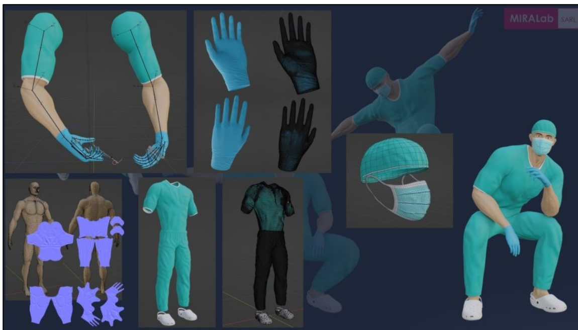
Figure 2 : Creating and animating the virtual 3D surgeon.