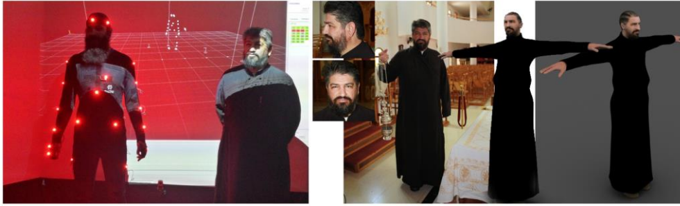
ITN-DCH project: case study of Asinou church - recreating the pope in 3D