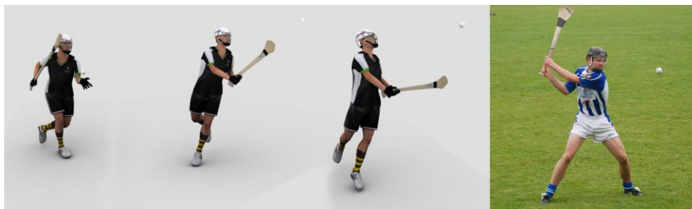
RePlay project: Preserving traditional participative sports – simulation in 3D of Gaelic games & Basque sports